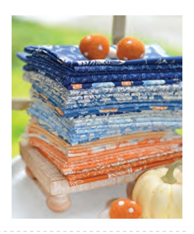
FIG TREE & CO