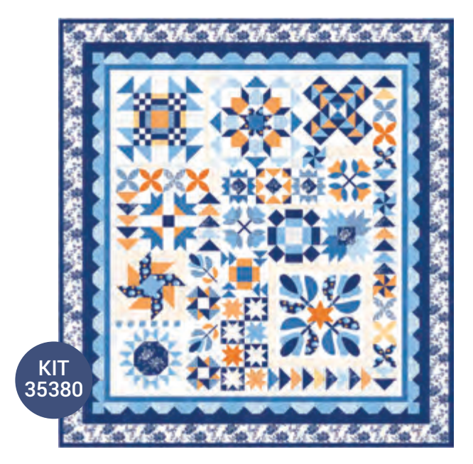
FT 1469B Halloween Figs: Denim Version 66" x 72" | KIT35380

I am a denim kind of gal all the way and wear jeans pretty much every day of my life. Mixing the denim "vibe" into a collection has long been on my design wishlist, and once I started mixing it up with my favorite orange and butterscotch colors. I knew I had discovered the perfect grouping of soft and strong. There is something about the utility of denim and strong blues with the warm, homey colors of tans, oranges, and butterscotch that makes it such a favorite combination for so many of us. I envision everyday decorating quilts and utility quilts to "use up" as well as beautiful heirloom two-color quilts. I cannot wait to see what you create with Denim & Daisies!